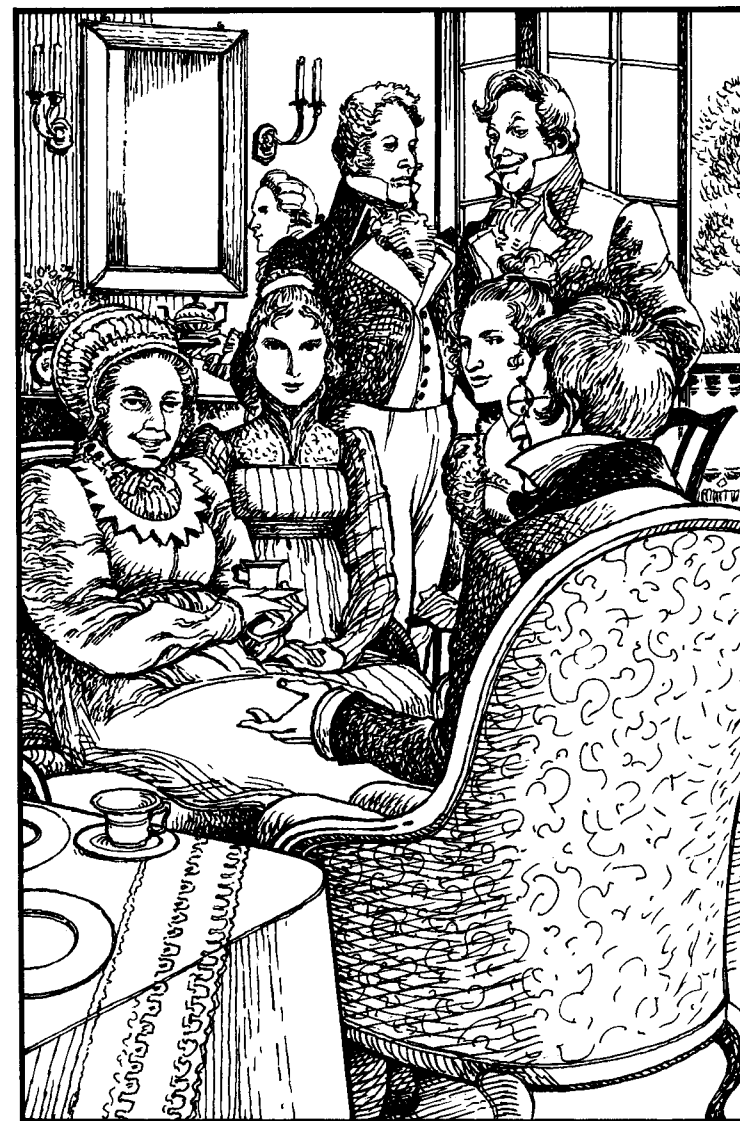
The Crofts visited the Hall with Mr Shepherd one afternoon, for tea.

They were very happy together, but only for a short time. Captain Wentworth spoke to Sir Walter one day.