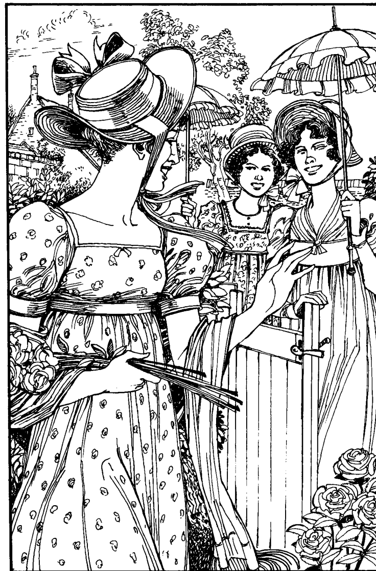
Anne liked the Cottage, with its garden of flowers and fruit trees.

Anne liked the Cottage, with its garden of flowers and fruit trees. Anne liked Mary's husband, Charles, too, and she liked Charles's two younger sisters, Henrietta and Louisa. They were pretty girls, nineteen and twenty years old. They liked dancing and singing and meeting new people. They were happy, friendly girls. And they liked Anne very much.