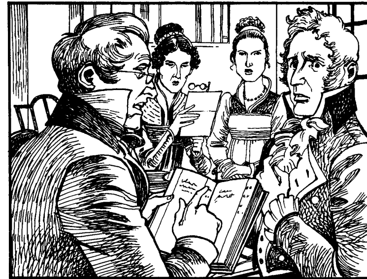
'You must leave Kellynch Hall. This house is too expensive for you.'

One day soon after this, Mr Shepherd was in Taunton, a town quite near Kellynch Hall. He met a man called Admiral Croft there, and his wife, Mrs Croft. The Crofts had no children and they were rich. Admiral Croft and his wife wanted to find a big house in Somersetshire, near Taunton.