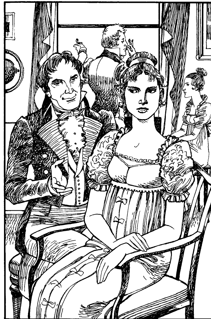
Mr Elliot was always friendly and polite to her – sometimes too friendly and polite perhaps.

Mary's letter told Anne that Louisa was better after her accident, but that she was in Lyme with the Harvilles. Louisa and the young Captain Benwick were in love, Mary said, and Captain Benwick wanted to marry her.