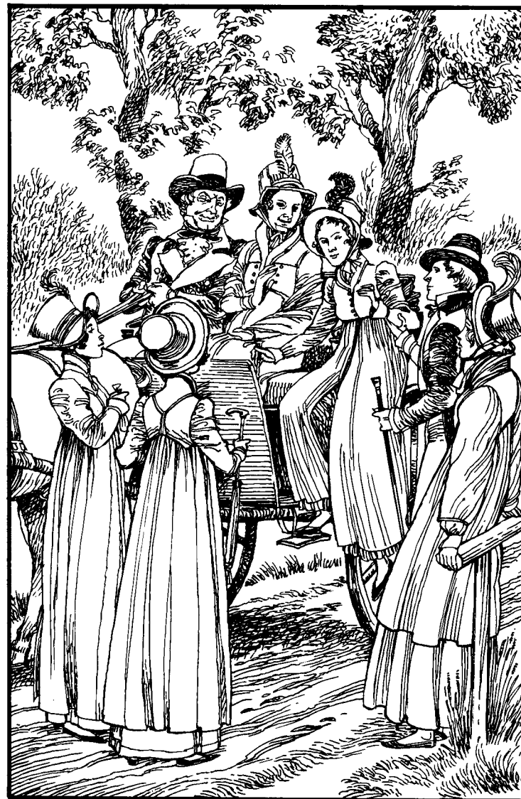
Without a word, he took her arm and helped her up into the Crofts' little carriage.

'I think it is time he found a wife now,' said the Admiral. 'He likes those two Musgrove girls, but the question is which of the two?'