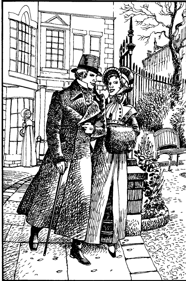
They talked about the love they now knew they had.

Anne did not move or speak. She was white. The others saw her white face. 'You are ill, Anne,' said Charles. 'I must find a carriage and take you home to Camden-place,' but Anne did not want to go in a carriage. She wanted to walk. She wanted to try to see Captain Wentworth in the street, to answer his letter with a word or a look. She wanted him to know, now, that she loved him, too.