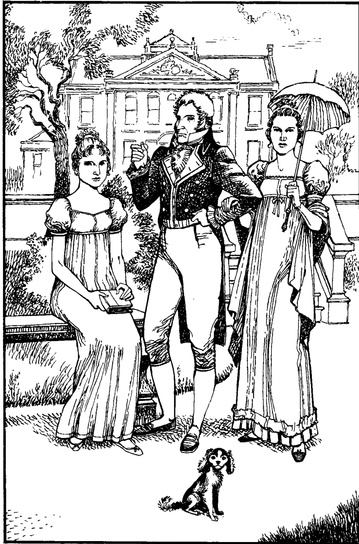
Sir Walter Elliot lived at Kellynch Hall with two of his daughters, Elizabeth and Anne.