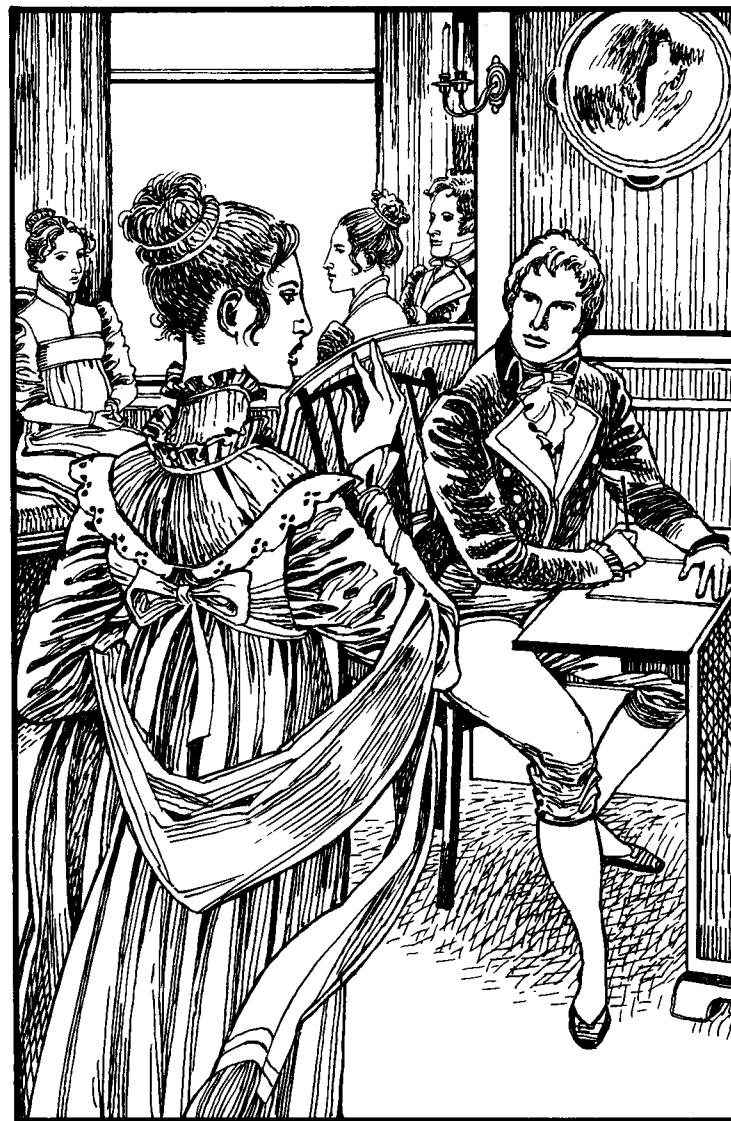
Captain Wentworth was there, at a desk in one corner of the room, writing a letter.

'I must speak. I cannot go on without knowing. My love for you is not dead – I cannot love anybody but you. Why do you think I am here in Bath? For you. What do I think about all day? You. You must see that I am waiting for you – after eight and a half years now, I am here waiting for you. Please do not tell me that I am too late. F.W.'