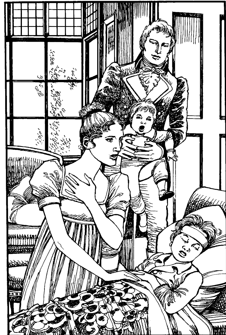
Captain Wentworth walked across the room, took the child off her back and carried him away.

For the next week or two, Anne was often with Captain Wentworth and Henrietta and Louisa Musgrove. They walked in the park or along the small roads to other villages