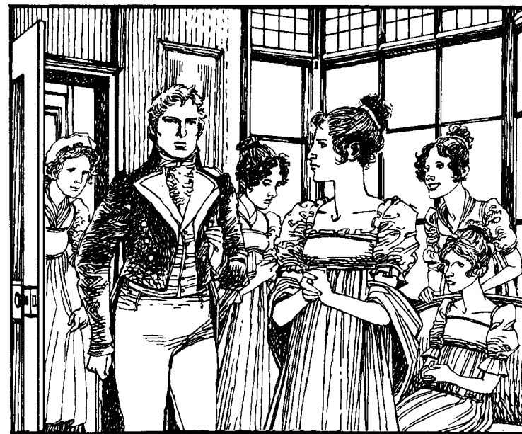
He came in, her eyes met his, he gave a small polite smile.

Charles and Mary went to the big house for dinner, too. Anne stayed with their two children at the Cottage. So Charles and Mary met Captain Wentworth for the first time. Charles invited him to visit them the next day at the Cottage and so it was there that Captain Wentworth and Anne met again after more than seven years.