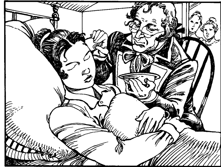
They put Louisa into Mrs Harville's bed and the doctor soon arrived.

It was a dark day with rain in the sky when Anne drove away from Uppercross with Lady Russell, to Bath. They