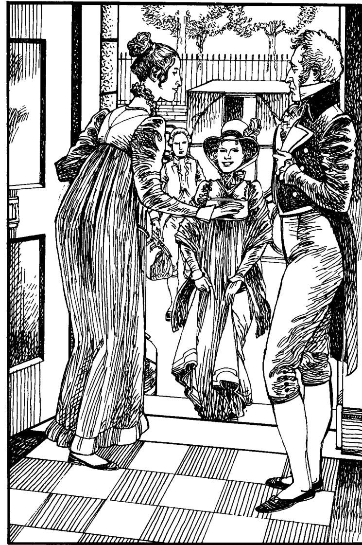
Anne's father and sister were happy to see her and show her their new house.

He sat down with them and they talked about Lyme and the hotel there and Anne told him about Louisa's accident.