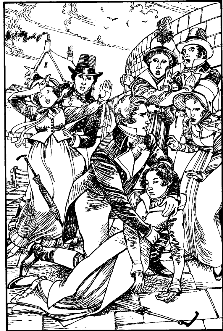
Captain Wentworth took Louisa's head in his arms.

'Help him! Help him!' said Anne. 'Leave me. I can easily look after Henrietta. Help Captain Wentworth with Louisa, quickly.'