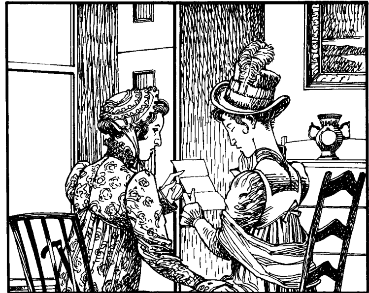
Her friend’s story was all true. Mr Elliot was a very bad man.

Anne listened to Mrs Smith’s story and she read some