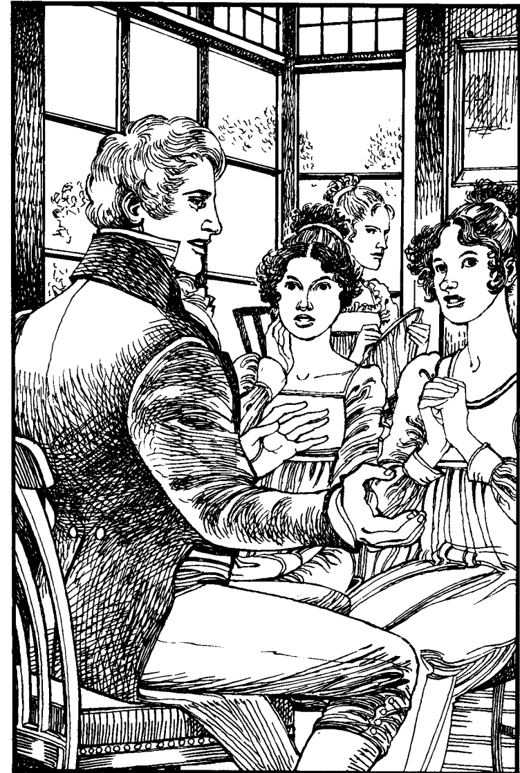
He talked a lot to Henrietta and Louisa. They liked listening to his stories of the sea.

‘They are coming in a minute, I think,’ said Anne.